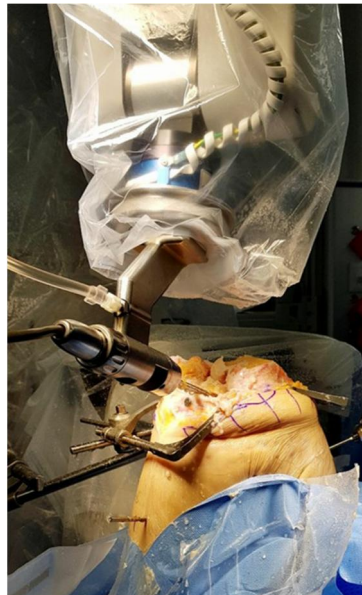
Figure 2: ROBODOC®-assisted total knee arthroplasty